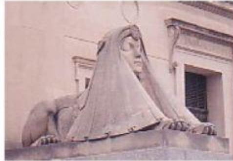
Woman headed sphinxes at the entrance to the Scottish Rite Temple, Kansas City, Missouri.